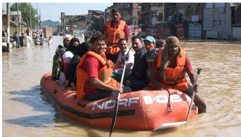
Evacuation process, J&K flood, 2014.