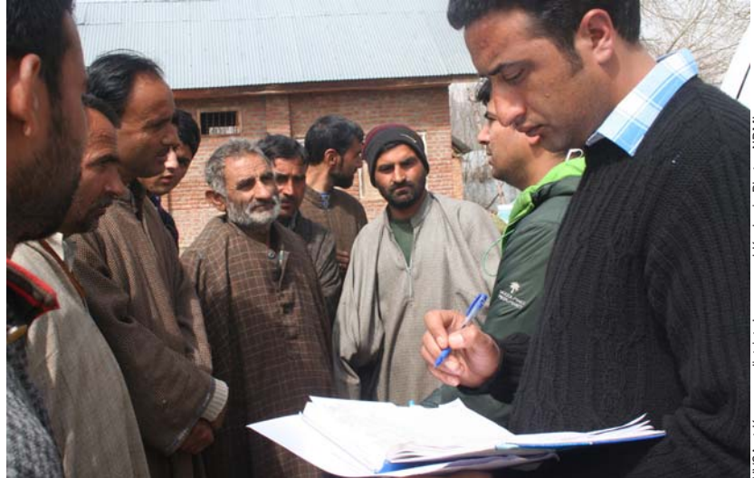
HVCA at Kupwara district, Jammu and Kashmir.

The natural disasters like the Earthquake, 2008 and the Floods, 2014, that occurred in Jammu and Kashmir (J & K) highlights the challenges of disaster risk reduction and climate change adaptation in the hilly and mountainous terrain of India. The few seconds of tremors or few hours of unprecedented rainfall followed by large-scale inundation due to overflowing rivers enhances both human as well as economic losses. While Earthquake is occasional, floods have become a recurring risk in the entire north-western Himalayan region.