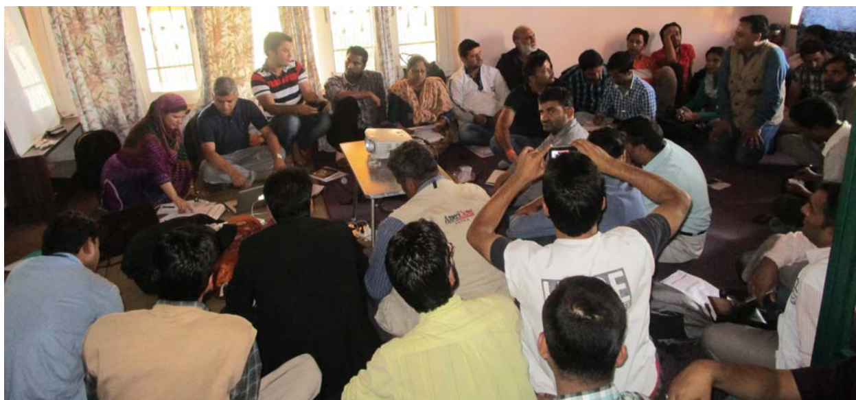
The second IAG Meeting which was organized in Srinagar on September 17, 2014 attended by 51 participants from 32 INGOs, NGOs, and CBOs.

Multi-stakeholder coordination was made possible and response was provided through establishing a GO NGO Coordination mechanism at State and district level. The development of common strategic