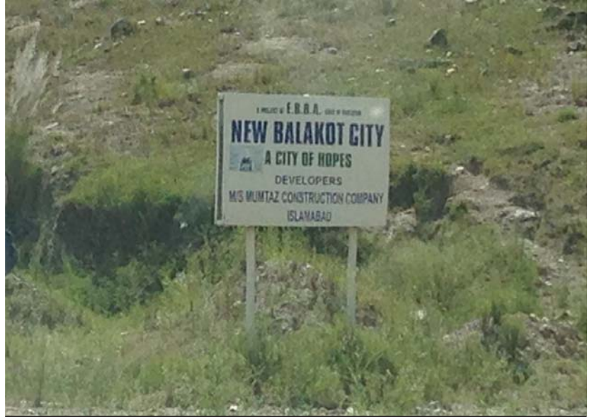
Hope remains a dream. Not a single house has been built.

I have been working with disaster prone communities since 1992. During this long interaction with the survivors of different kinds of disasters, I learnt one important lesson – besides looking at devastation, it is essential to look at how survivors cope with the emergency. What are they doing together and how decisions are made and implemented? Consider what we found the next day of the