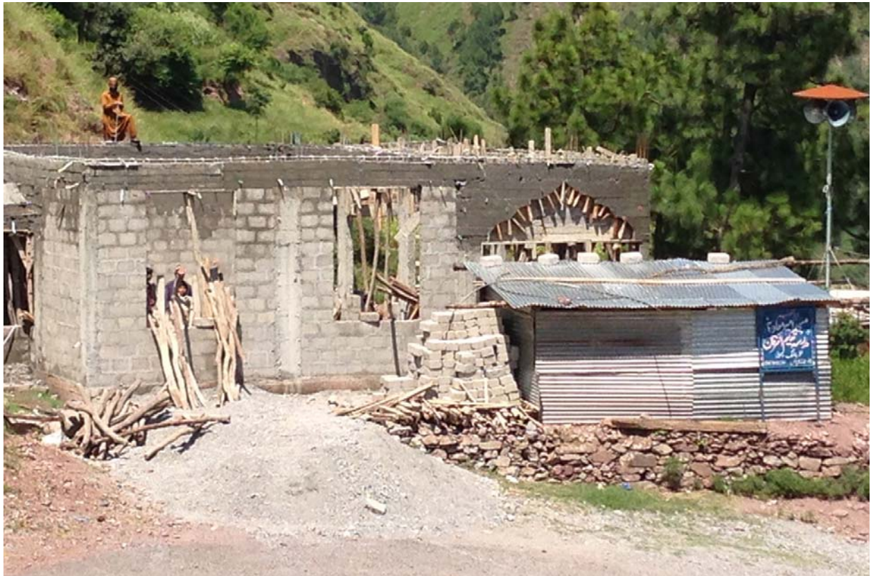
Ten years after the earthquake, a family in Balakot starts constructing the house, after receiving money from a family member who works in the Middle East.