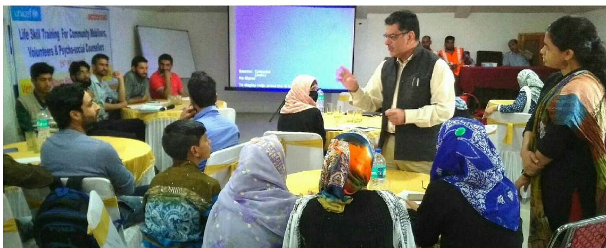
Awareness on Psycho Social affects of Disasters.

The State has thus, adopted the twin principle of minimizing human suffering, during disasters and reduction of financial losses through integration of DRR activities into development planning.