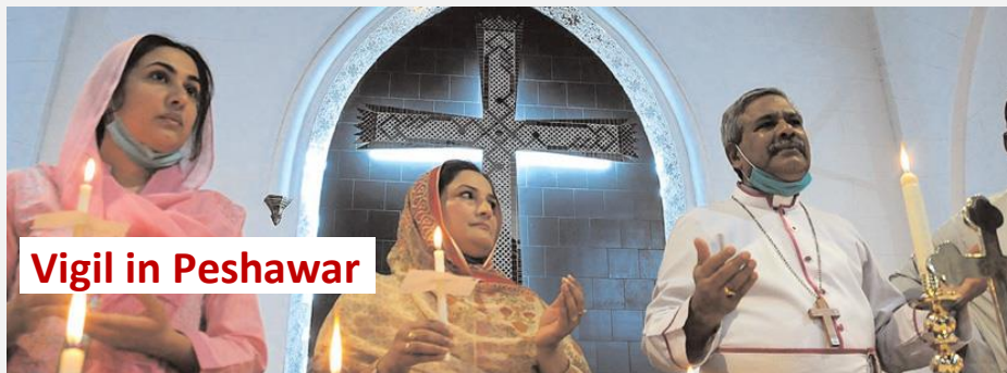
Vigil in Peshawar

Foreign Minister told the media on 31 May in Multan that minorities in Pakistan were completely safe, with their worship places protected, Daily Times reported.